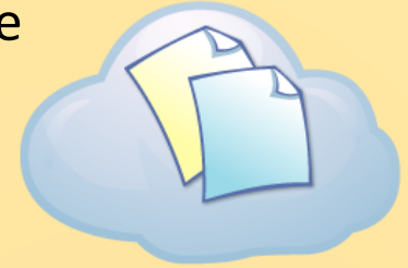
Online or Cloud System