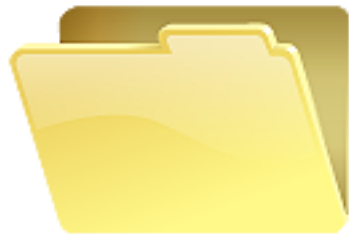
Windows File System