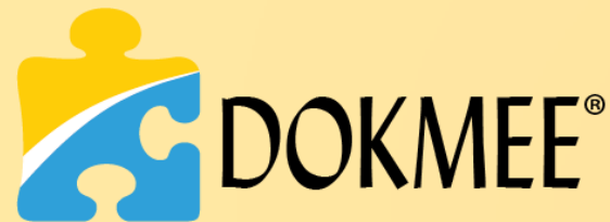
Document Management System